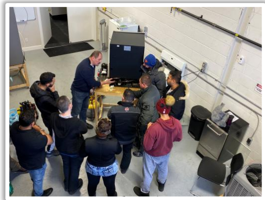
Training on a Sealed System Refrigeration unit.

Program delivery format: on campus (Mississauga Campus)